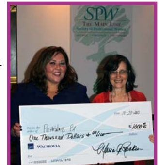
WACHOVIA, A WELLS FARGO COMPANY SURPRISES PATHWAYS PA WITH A DONATION OF $1,000!

Our featured non-profit, PathWays PA, left with over 250 toiletries and other personal items for families in need. PathWays PA has served over 6,000 families in crisis by assisting them to become self sufficient. A big thank you to SPW for your continued generosity!